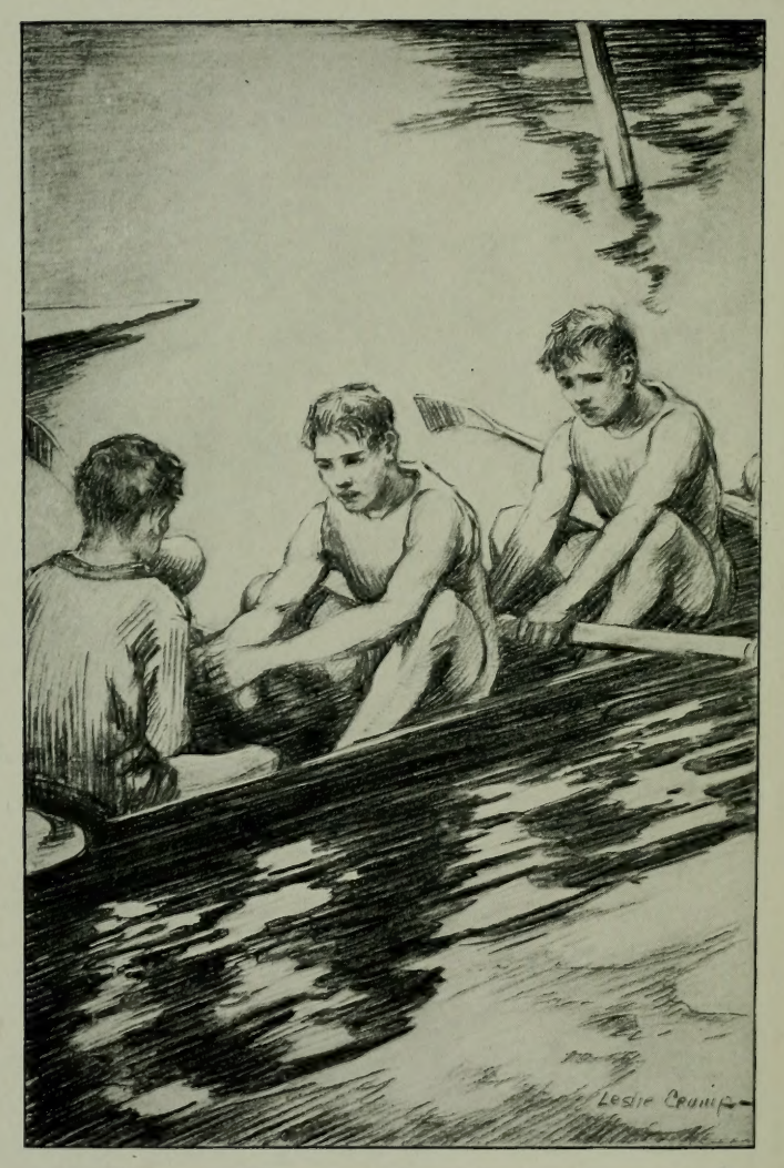
"Ten more!" he yelped. "Ten hard ones!"